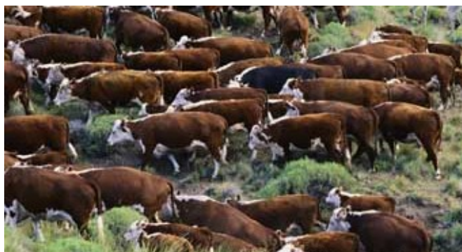
Cattle : Their wellbeing is targeted by the CTTBD

The Centre has a farm of 65 hectares whose primary function is to house sufficient disease free cattle for use in vaccine stabilate production, for conducting contract research and as a quarantine facility to generate income for the Centre. However, the farm is also used for training purposes when need arises. The farm has cattle holding facilities for up to 300 cattle. In addition, a rabbitry housing about 40 rabbits forms part of the animal quarters. This will soon be replaced by a bigger unit under construction which will house over 500 rabbits. There is also a tick-breeding facility for maintenance of the tick population which is used during stabilate production.