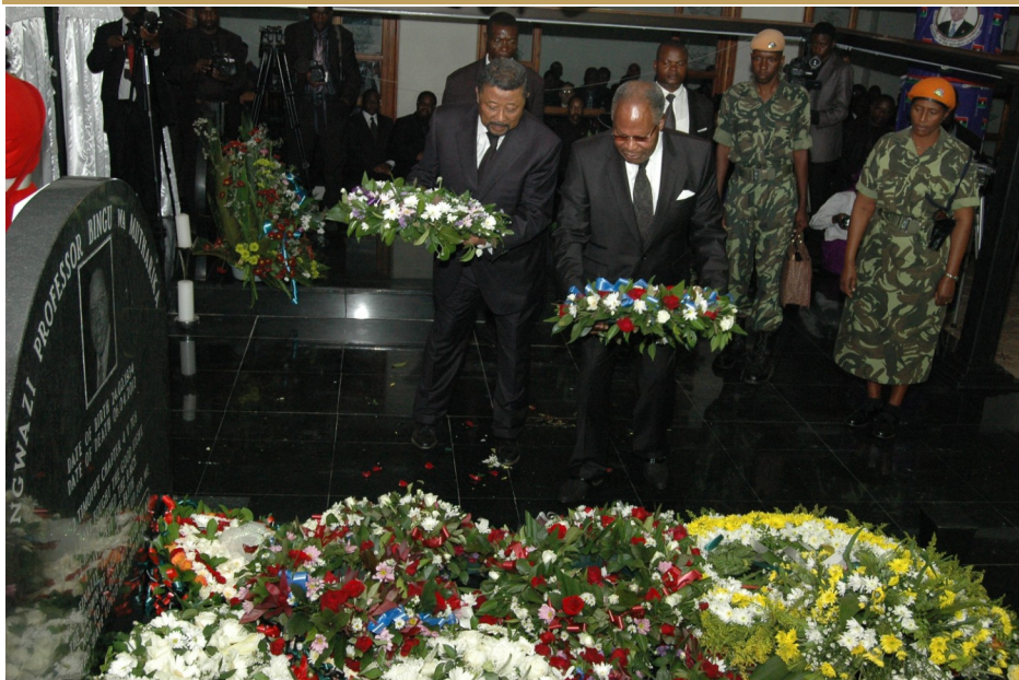
AUC Chairperson Jean Ping(L) and Former Malawi President, Bakili Muluzi (R) laying wreaths on the tomb of Late Wa Mutharika during the burial ceremony at Ndata Farm.

The Chairperson of the African Union Commission (AUC), Dr Jean Ping has hailed Malawi for the peaceful transition of power following the sudden death of the country's President His Excellency Ngwazi Prof. Bingu wa Mutharika on 5th April 2012.