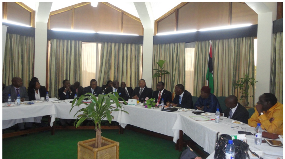
AUC delegation reporting its findings to the Malawi Government Ministerial Committee on the summit at a meeting held at Malawi's Office of President and Cabinet (OPC).

About 4,000 plus delegates are expected to attend the Summit.