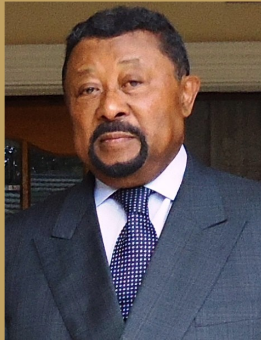
AUC Chairperson, Dr Jean Ping

With new technologies such as social media, the people and the youth in particular, are rising to protest against all forms of injustice imposed on them and especially against infringements on the freedom of expression and human rights. For it is above all, by words and messages, that human beings exist. To deny this right is simply to suppress the whole concept of democracy. In deed, popular uprisings have introduced a new dimension in relations as well as in communication between the government and the governed.