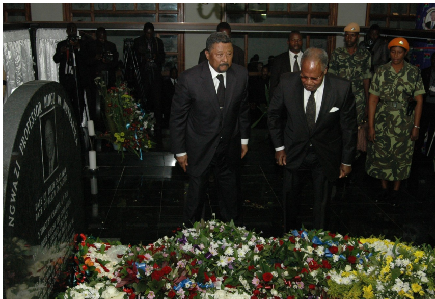
AUC Chairperson Jean Ping (L) and Former Malawi President, Bakili Muluzi (R) laying wreaths on the tomb of Late Wa Mutharika during the burial ceremony at Ndata Farm.