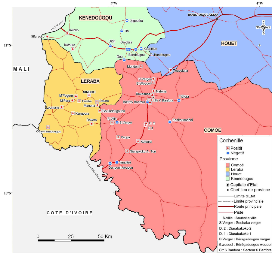
Fig. 1& 2: areas infested by R. invadens in Burkina Faso.