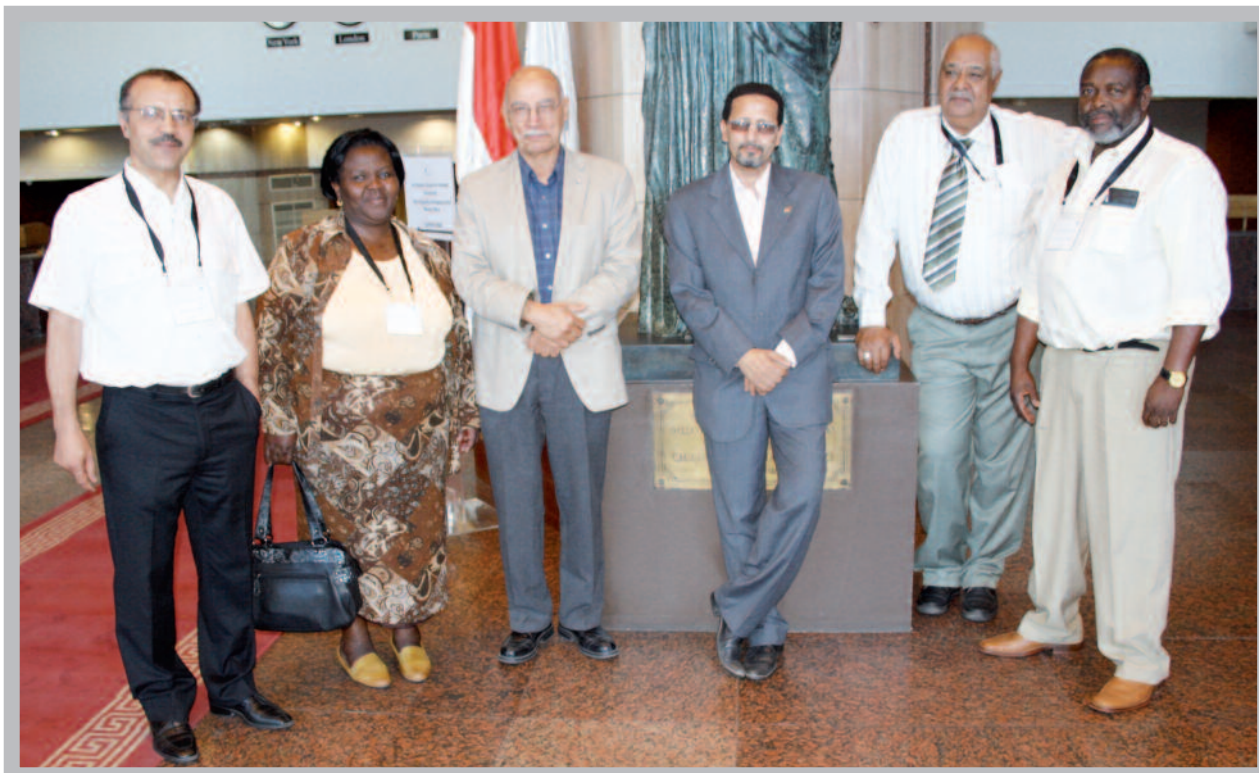
Group photo for experts with AU - / IAPSC Senior scientific officer for Entomology ( in dark suit)