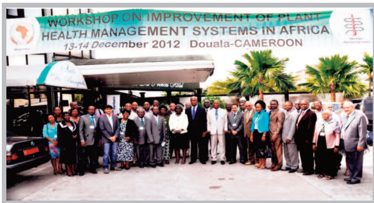
Hotel Valée des Princes Douala, Cameroon