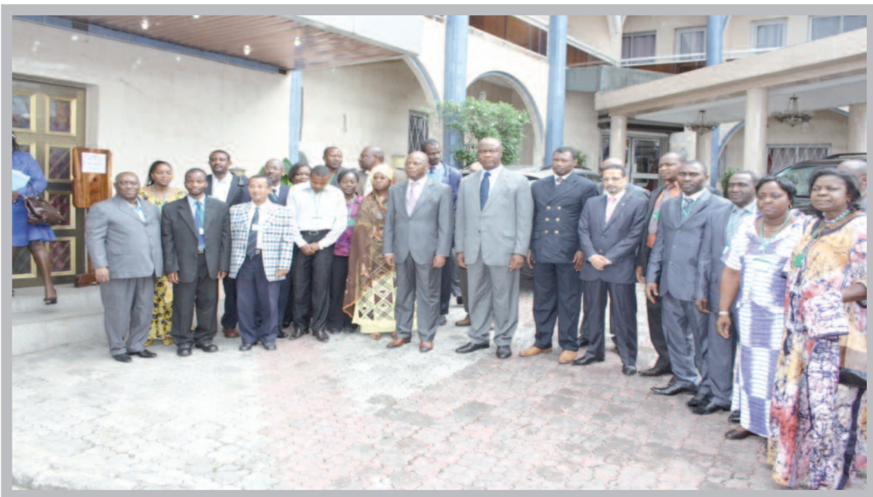
Group photo of workshop participants