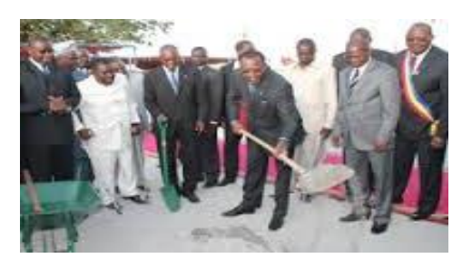
3.4.3. Toumaï Award for Innovation