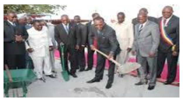
1.2.4.3. Toumaï Innovation Prize

Here, I was personally launching construction work of the ACIT building.