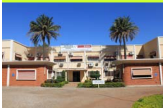
AU SAFGRAD HeadQuarters in the Center of Ouagadougou (BURKINA)