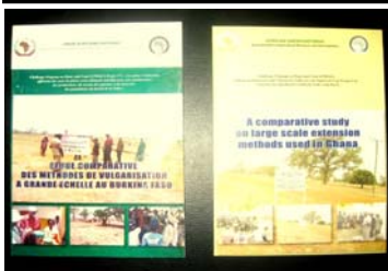
AU SAFGRAD Publications

The above mentioned documents have been disseminated to the decision makers in the relevant countries as well as to all the relevant institutions all over the world. Copies (PDF format ) are available on the AU SAFGARD Website at http://www.au-safgrad.org