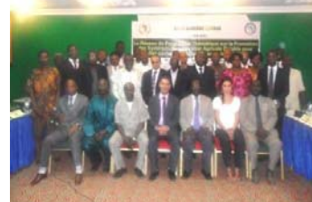
TPN6 Meeting attended by various stakeholders in Ouagadougou in 2011 to discuss the manual of the network

In 2008, under this program the conference on the enhancement of rural livelihoods in semi-arid Africa took place in Addis Ababa. The conference which was well attended by over 120 participants discussed the background document on development of rural livelihoods in semi-arid Africa: issues, challenges, and opportunities . Participants endorsed the proposal contained in the document and made recommendations for moving forward. The report of the conference has been submitted to