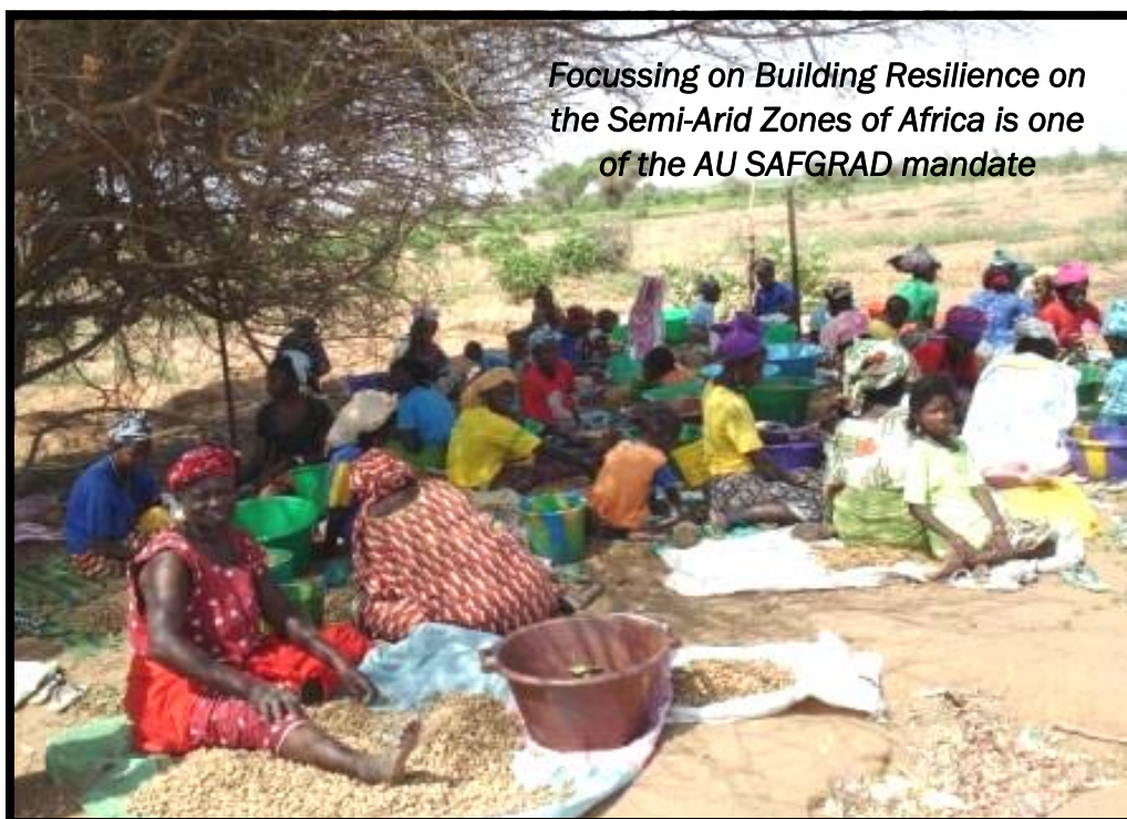
Focussing on Building Resilience on the Semi-Arid Zones of Africa is one of the AU SAFGRAD mandate

"To accelerate sustainable agricultural development and rural livelihoods in semi-arid Africa by building resilience of rural communities through working in partnership with African and global research and development organizations".