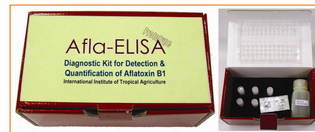
Afla-ELISA™, an in-house aflatoxin estimation kit, provides sensitive, reliable, quantitative detection of aflatoxins in various agricultural commodities using an indirect competitive ELISA principle via colorimetric measurements.