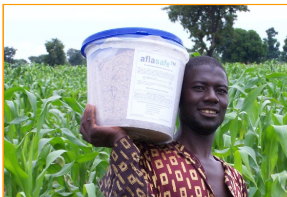
A farmer carrying a box of Aflasafe™ (a registered trademark of IITA) to protect his maize crop against aflatoxins. Biocontrol-producing spores in Aflasafe™ land on maize and outcompete toxigenic strains.