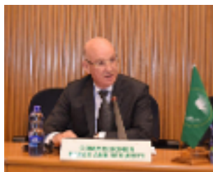
Smail Chergui , Commissioner for Peace and Security

I wish you a successful celebration of the African Border Day.