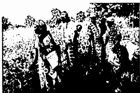
Figure 3: Group soya bean seed farm in Ghana Nanumba

Women's access to land is another area which needs urgent attention in the year of women's empowerment and development. It is difficult to discuss sustainable agriculture without considering access to and control of land. In Ghana where 75% of women smallholder farmers said they had no land at the time of baseline3 data collection in 2012, women's groups have negotiated for land with local authorities and have been given land to grow soybean seeds, maize and other crops. This group farming has also resulted in changes in male attitudes at home as they are now aware that women need land.