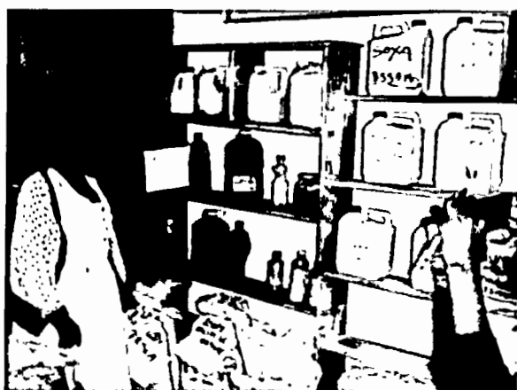
Figure 1: Seed and grain bank in Rwanda: Photo ActionAid

Women smallholder farmers have become less dependant on private companies who sell mostly hybrid seeds at high prices.