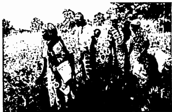
Figure 3: Group soya bean seed farm in Ghana Nanumba

Women's access to land is another area which needs urgent attention in the year of women's empowerment and development. It is difficult to discuss sustainable agriculture without considering access to and control of land. In Ghana where 75% of women smallholder farmers said they had no land at the time of baseline3 data collection in 2012, women's groups have negotiated for land with local authorities and have been given land to grow soybean seeds, maize and other crops. This group farming has also resulted in changes in male attitudes at home as they are now aware that women need land.