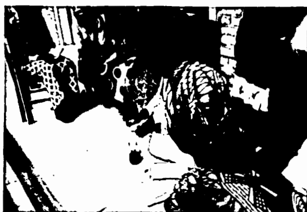
Figure 2: Women prepare seed for storing in seed bank