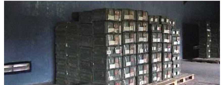
Figure 1 - Poor stock management means that some of the contents of the boxes at the bottom of the stack are actually very old.

A number of capacities are required to address the issue of deteriorating ammunition, including in terms of human resources, information management and monitoring, as well as logistical and disposal capacity. Further compounding these issues is a lack of awareness of ammunition deterioration and shelf life, which can occur through insufficient training, inadequate stock record keeping, and poor awareness of environmental and handling factors.