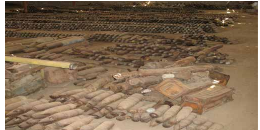
Figure 2 - An ammunition store containing unused ordnance, recovered unexploded ordnance (some in a very unstable condition) and wooden and paper waste material.

Storage infrastructure is costly both to establish and maintain, especially when building to internationally recognised ammunition storage requirements. In addition, storage infrastructure has no inherent sustainability in the absence of associated governance structures, including, most notably, the active management of the stock within the storage facility. PSSM interventions that focus solely on storage infrastructure are likely to fail in the longer term, and recognition is