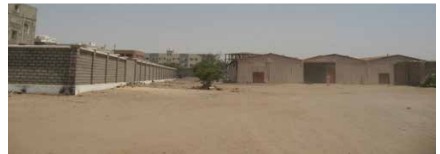
Figure 3 - This is the same ammunition store. It is in an unprotected light building with considerable urban development outside the compound, including one new apartment building within 100m.

needed that storage itself is a long-term, costly decision. However, it should also be recognised that shortcuts in storage infrastructure constitute acceptance of reduced safety margins in comparison to international standards, and should not be regarded as an acceptable long-term solution. Recommendations for storage infrastructure therefore revolve around: