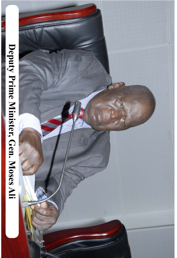
Deputy Prime Minister, Gen. Moses Ali