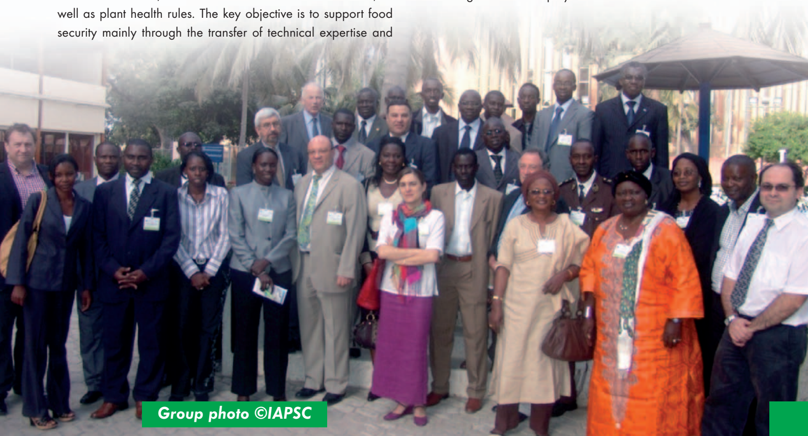
Group photo

policy advice in areas of food safety and quality across Africa. The knowledge, expertise and skills transferred will help to produce and distribute agro-food products compatible with international SPS standards, contributing towards reducing the likelihood of food-borne diseases and related health and socio-economic burdens. At the micro level, the activities will help improve the use of agricultural inputs (fertilisers, pesticides, veterinary drugs,) and good hygiene practices in the production and distribution chains, as well as animal/product management of control and certification systems, strengthening the competent authorities and producers' associations (small & medium-sized enterprises (SMEs). At the macro level, the activities will support the gradual integration and competitiveness of the agro-food sector, strengthening the vital role of agriculture as a whole towards rural development and food security, with positive knock-on effects on growth and employment in Africa.