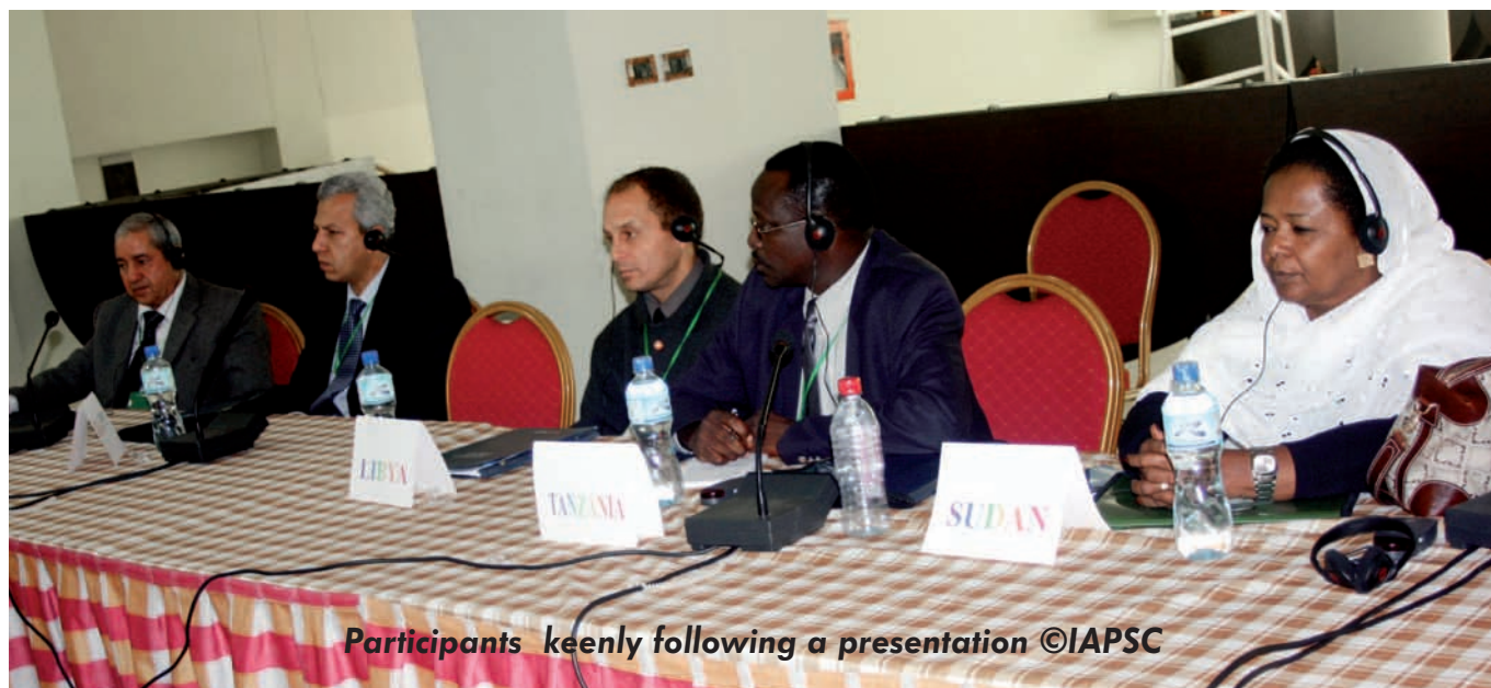
Participants keenly following a presentation

institutional capacities to provide the basic understanding upon which to set up and implement appropriate measures. He added that the challenge is to acquire the required knowledge of the biodiversity resources, knowing what the critical species are, where they occur, obtaining information about their natural history and establishing databases.