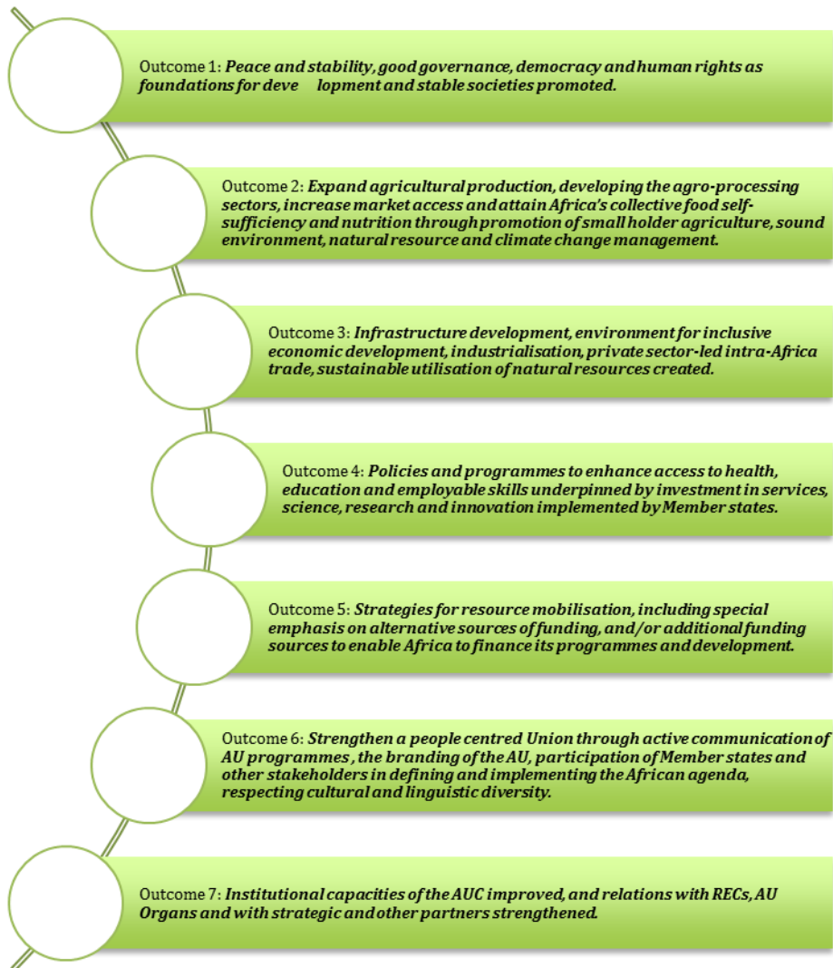
Figure 3: 7 Outcomes of the AU Commission 3 rd Strategic Plan

74. Ahead of plans to develop the next AU Commission Strategic Plan for presentation to the Summit in July 2017, a review of the 3 rd Strategic Plan was conducted at the beginning of October 2016.