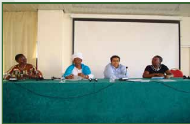
Equality Now with representatives from UNIFEM, AU and Oxfam GB at a meeting on domestication of the protocol in Kigali, Rwanda, July 2009