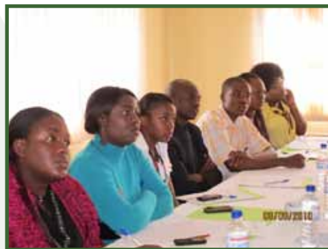
Journalist training, Zambia 2010