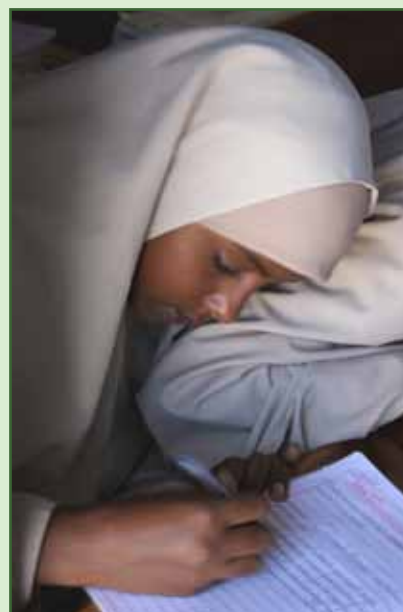
School girl in Somalia

In its General Recommendation No. 19 on violence against women, the Committee on the Elimination of Discrimination against Women specifically mentioned forced marriage and rape stating that "The effect of such violence on the physical and mental integrity of women is to deprive them the equal enjoyment, exercise and knowledge of human rights and fundamental freedoms." The Human Rights Committee, in its General Comment No. 28 on equality of rights between men and women, identified women's right to free and informed consent in marriage as an element of women's right to equality. The Committee on the Rights of the Child, in its General Recommendation No. 4 on adolescent health and development, found that early marriage was a harmful traditional practice that negatively affects girls' sexual and reproductive health.