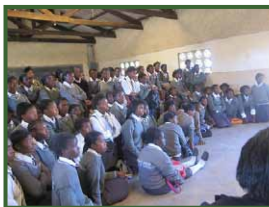
Kamulanga High School Safe Space for Girls in Zambia

The rights of girls under 18 years are also covered by the African Charter on the Rights and Welfare of the Child (the Children's Charter), which came into force in November 1999 ( see Appendix I). As of May 2011, 46 countries have ratified this Charter ( see Box 1.4). The Children's Charter makes specific mention of the right of the girl child to have access to education, and for a pregnant girl to be afforded an opportunity to complete her education. It guarantees the right of girls to not be exposed to harmful social practices, which could include female genital mutilation. The Children's Charter also addresses sexual exploitation, and the sale, trafficking and abduction of children, all of which primarily affect the girl child. The African Committee of Experts on the Rights and Welfare of the Child was established in 2001 pursuant to Articles 32 through 46 of the Children's Charter. This Committee under Article 44 considers communications received about violations of children's rights. 6