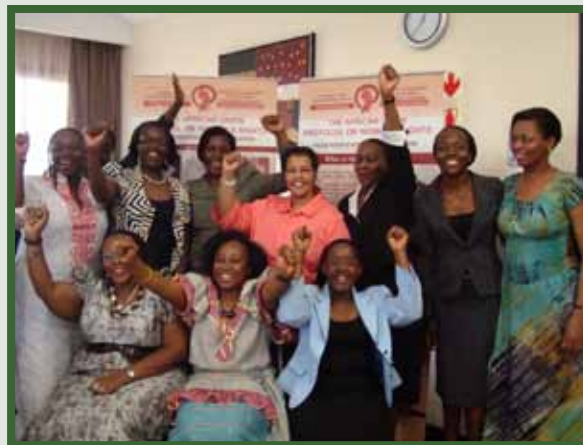
SOAWR members celebrating ratification of the Protocol by Uganda

Association, Femmes Africa Solidarite, African Women's Development and Communication Network (FEMNET), Malian Women Lawyers Association, Senegalese Women Lawyers Association, Women in Law And Development in Africa (WiLDAF), and Women's Rights Advancement and Protection Alternative (WRAPA). This consensus text was based on existing international instruments, such as the Convention on the Elimination of All Forms of Discrimination against Women (CEDAW), but specifically adapted to the African context. The NGO group then advocated for a strong Women's Rights Protocol with governments.