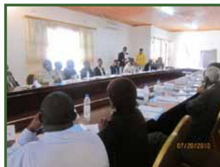
Paralegal Training in Zambia