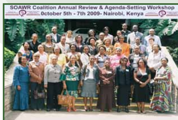
SOAWR members in Nairobi, October 2009

Not all Member States of the AU are party to the Women's Rights Protocol (see Box 1.4). In States which have yet to ratify the Women's Rights Protocol, advocacy strategies will no doubt focus on ratification. NGOs, in many countries, have successfully formed networks and alliances to run campaigns on ratification. In this regard, they have used key figures in the struggle for women's rights and other prominent actors at domestic level to champion the campaigns. Encouraging ratification has been done through, among other things, awareness-raising campaigns and discussions with government officials at sessions of the African Commission, AU Summits, the AU missions in Addis Ababa, Ethiopia, and at the country level. 249