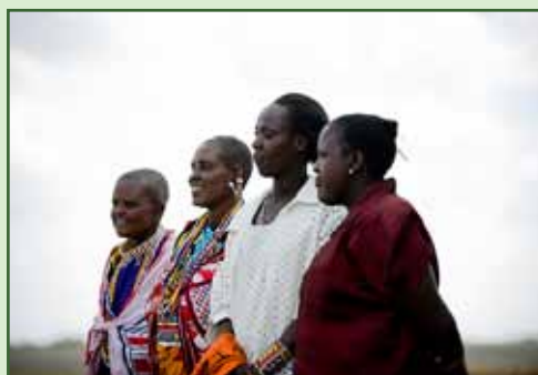
Kenyan Women in Narok

The Human Rights Committee, in its General Comment No. 3 on equality of rights between men and women, has interpreted compliance with Article 7 (torture or cruel, inhuman and degrading treatment) of the ICCPR as requiring the State to give "access to safe abortion to women who have become pregnant as a result of rape" and "prevent forced abortion and forced sterilization." The Committee went on to state that policies such as those requiring a husband's authorization to make a decision regarding sterilization; mandating sterilization after a certain age or a certain number of children; or "States impose a legal duty upon doctors and other health personnel to report cases of women who have undergone abortion" violate a women's right to privacy under Article 17 of the ICCPR, and may also violate her rights to life under Article 6 and against being subjected to torture or cruel, inhuman and degrading treatment under Article 7 of the ICCPR. The Committee on the Elimination of Discrimination against Women has, in its General Recommendation No. 24 on women and health, identified "laws that criminalize medical procedures only needed by women and that punish women who undergo those procedures" as a barrier to women's right to health.