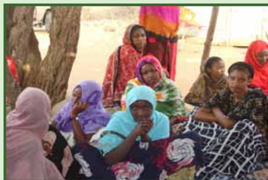
Djibouti women and girls discuss ending violence against women

In its General Recommendation No. 19 on violence against women, the Committee on the Elimination of Discrimination against Women noted that gender-based violence is a form of discrimination and constitutes a violation of equality rights set out in CEDAW. The Committee recommended that States ensure that laws against family violence and abuse, rape, sexual assault and other gender-based violence give adequate protection to women and respect their integrity and dignity and that States provide appropriate protective and support services for victims. The CRC also addresses violence and sexual abuse against, and exploitation of, children, including girls, in Articles 19 and 34, and requires States to take comprehensive measures to protect children from such violence and abuse. The Human Rights Committee, in its General Comment No. 28 on equality of men and women, has interpreted compliance with Article 7 of the ICCPR (torture, cruel, inhuman or degrading punishment or treatment) to require States to have laws on "domestic and other types of violence against women, including rape."