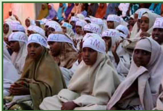
School girls in Galkacyo, Somalia campaigning against FGM

Failure to take comprehensive measures to eliminate female genital mutilation also violates Articles 2(f) (modify or abolish existing laws, regulations, customs and practices which constitute discrimination against women) and 5 (eliminate customary practices which are based on the idea of the inferiority or the superiority of either of the sexes or on stereotyped roles for men and women) of CEDAW; as well as Article 24(3) (abolish traditional practices prejudicial to the health of children) of CRC. The Human Rights Committee, in its General Comment No. 28 on equality of rights between men and women, interpreted compliance with Articles 7 (torture, cruel, inhuman or degrading treatment or punishment) and 24 (special protection for children) to require States to take measures to eliminate female genital mutilation.