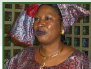
Special Rapporteur Soyata Maiga

The African Commission has special mechanisms such as special rapporteurs and working groups to bolster its activities in the promotion of human and peoples' rights. The Special Rapporteur on the Rights of Women in Africa is one such mechanism established in 1998 who is selected from among the Commissioners.