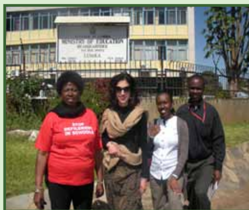
Equality Now and local activists on ending sexual violence in Zambian schools

*Judgement on file at Equality Now ( equalitynownairobi@equalitynow.org )